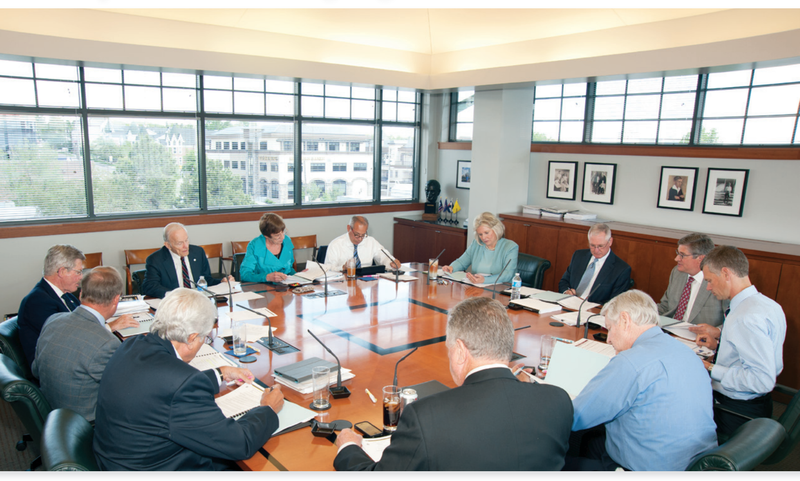
In session: a meeting of the Daniels Fund Investment Committee

The Daniels Fund is known for providing grants and scholarships, but there's a lesser-known side of our operations that's essential to accomplishing our mission. Most people don't know that the ongoing work of our finance and investment team is what allows us to continue our charitable giving while maintaining, or even growing, our total assets.