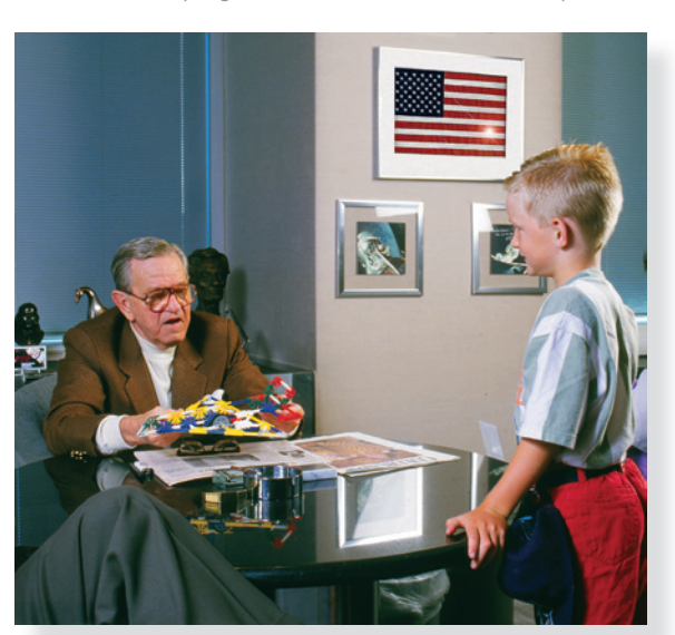
Bill wanted to prepare young people to succeed in the free enterprise

the potential of applying free enterprise principles, like choice and competition, to the educational system.