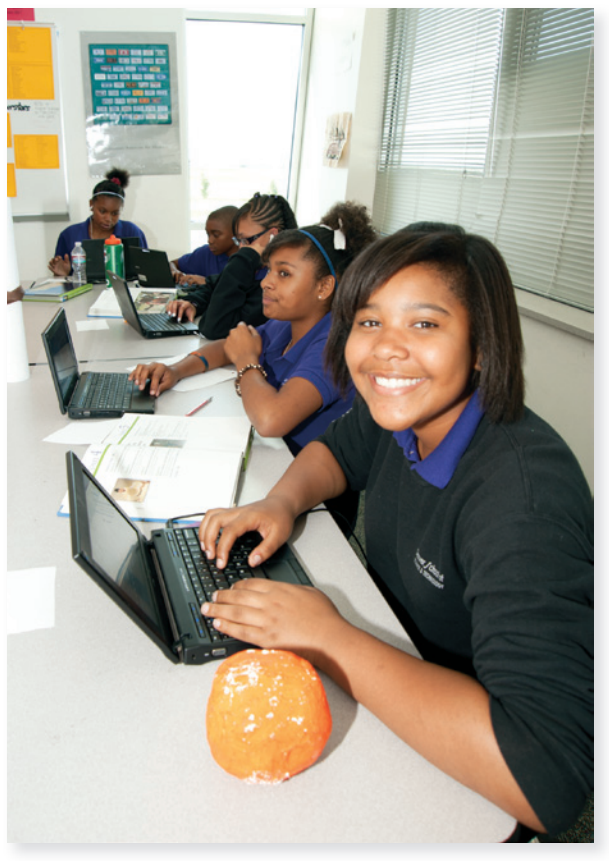
Quality education has made a welcome return to northeast Denver classrooms

DSST: Green Valley Ranch Middle School, one of the first charters to open in the area, ended the 2010/2011 school year as the best-performing DPS secondary school. Among the school's 141 students, 56% qualified for the free or reduced lunch program and 74.3% tested at or above CSAP proficiency.