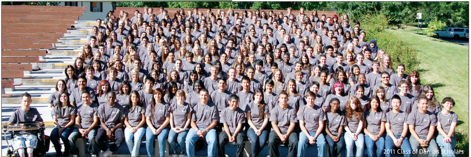
2011 Class of Daniels Scholars