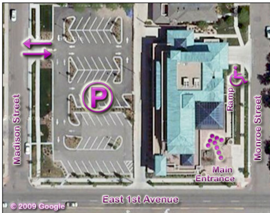
Arial View of Daniels Fund Building and parking lot

Daniels Fund 101 Monroe Street Denver, CO 80206 303-393-7220